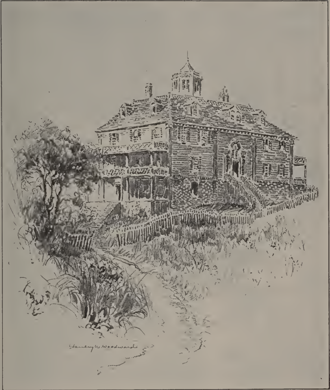
GOVERNOR SHIRLEY'S MANSION